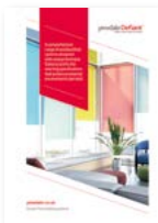
yewdale Defiant ® FABRIC AND BLIND SYSTEMS