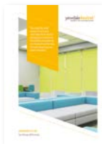
yewdale Kestrel ® MAGNETIC ANTI-LIGATURE SYSTEM