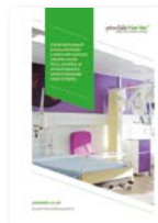
yewdale Harrier ® CUBICLE AND SHOWER CURTAINS