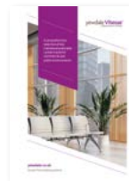
yewdale Vitesse ® CURTAIN TRACK SYSTEMS