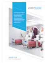
yewdale Movatrack ® CUBICLE AND TRACK SYSTEMS