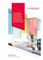
yewdale Defiant ® FABRIC AND BLIND SYSTEMS