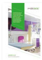
yewdale Harrier ® CUBICLE AND SHOWER CURTAINS