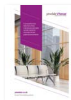
yewdale Vitesse ® CURTAIN TRACK SYSTEMS