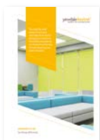
yewdale Kestrel ® MAGNETIC ANTI-LIGATURE SYSTEM