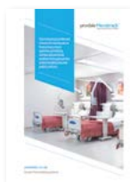
yewdale Movatrack ® CUBICLE AND TRACK SYSTEMS